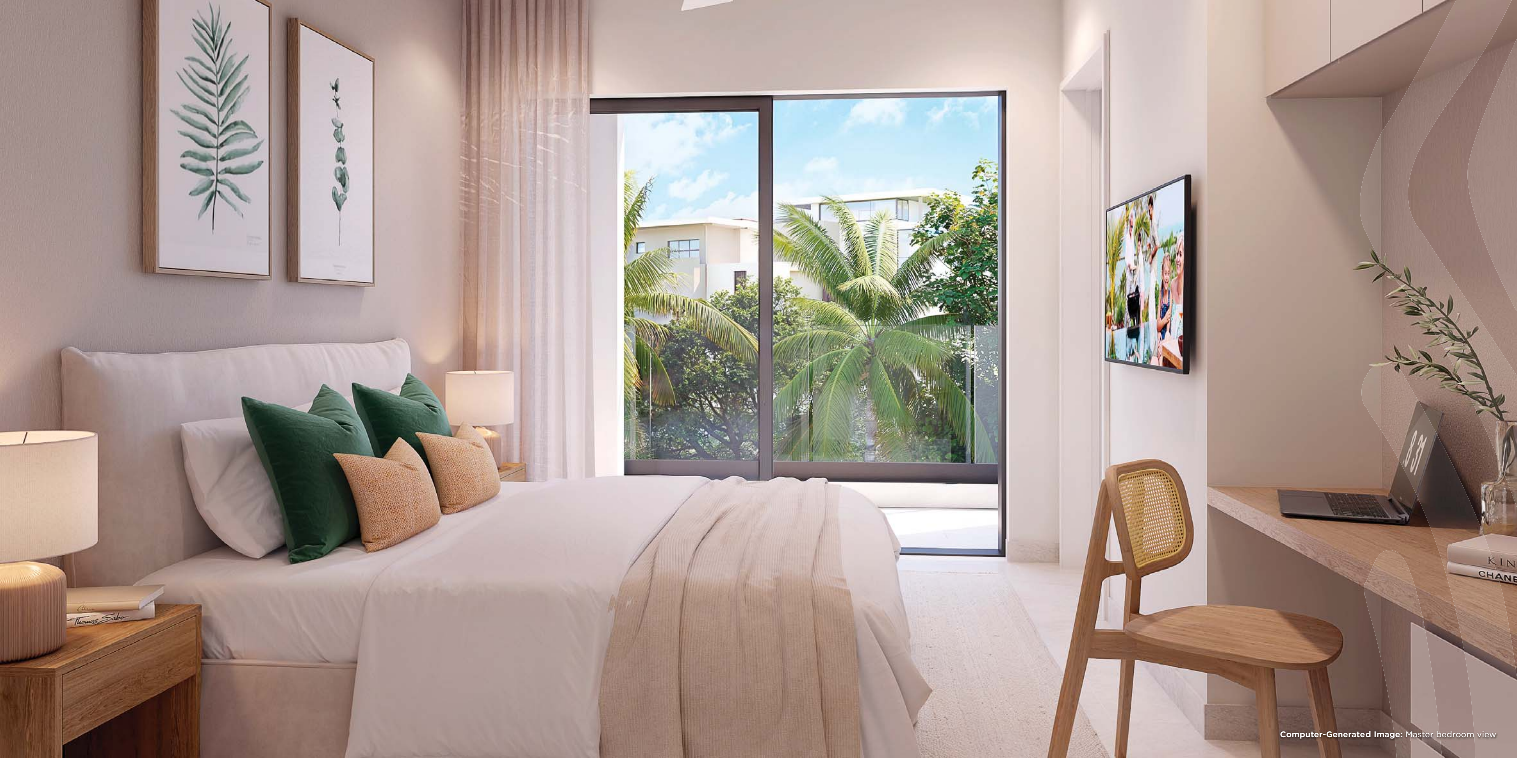
Computer-Generated Image: Master bedroom view