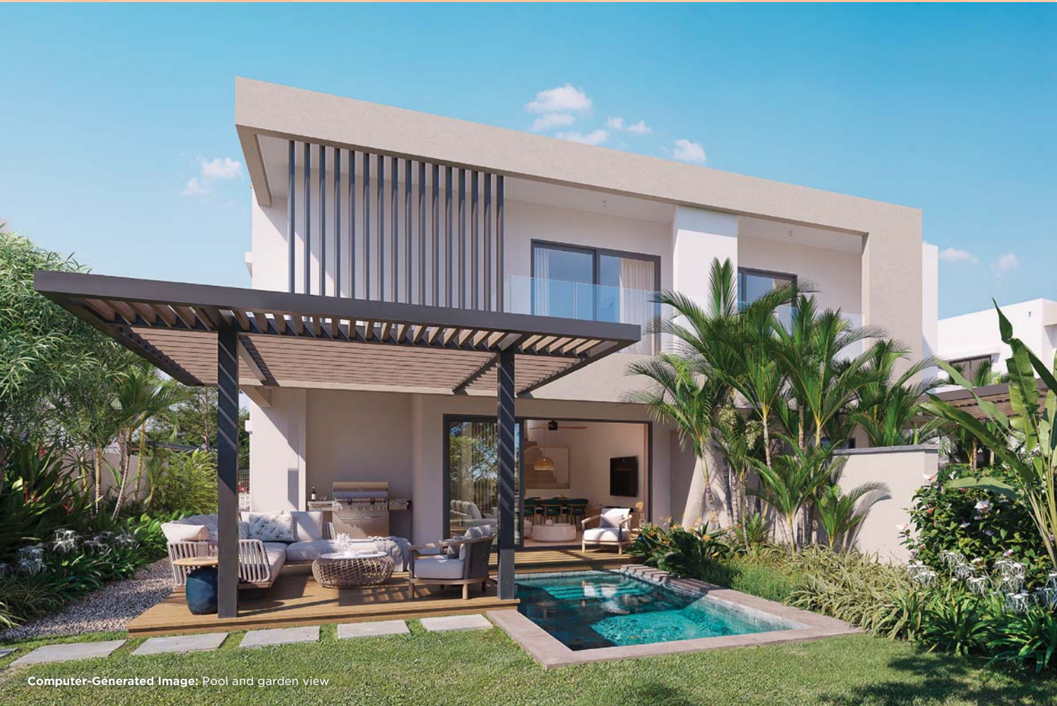
Computer-Generated Image: Pool and garden view