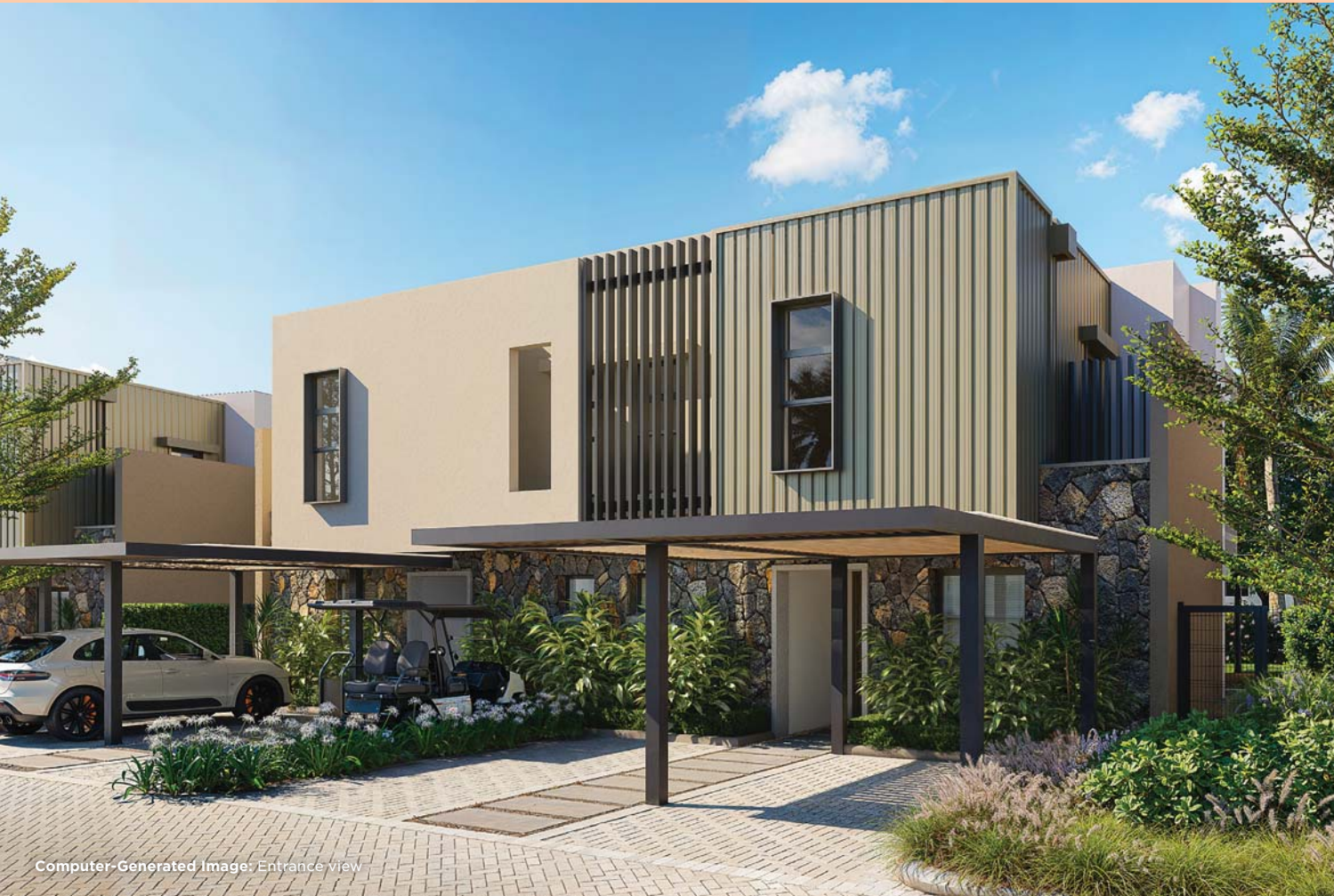
Computer-Generated Image: Entrance view