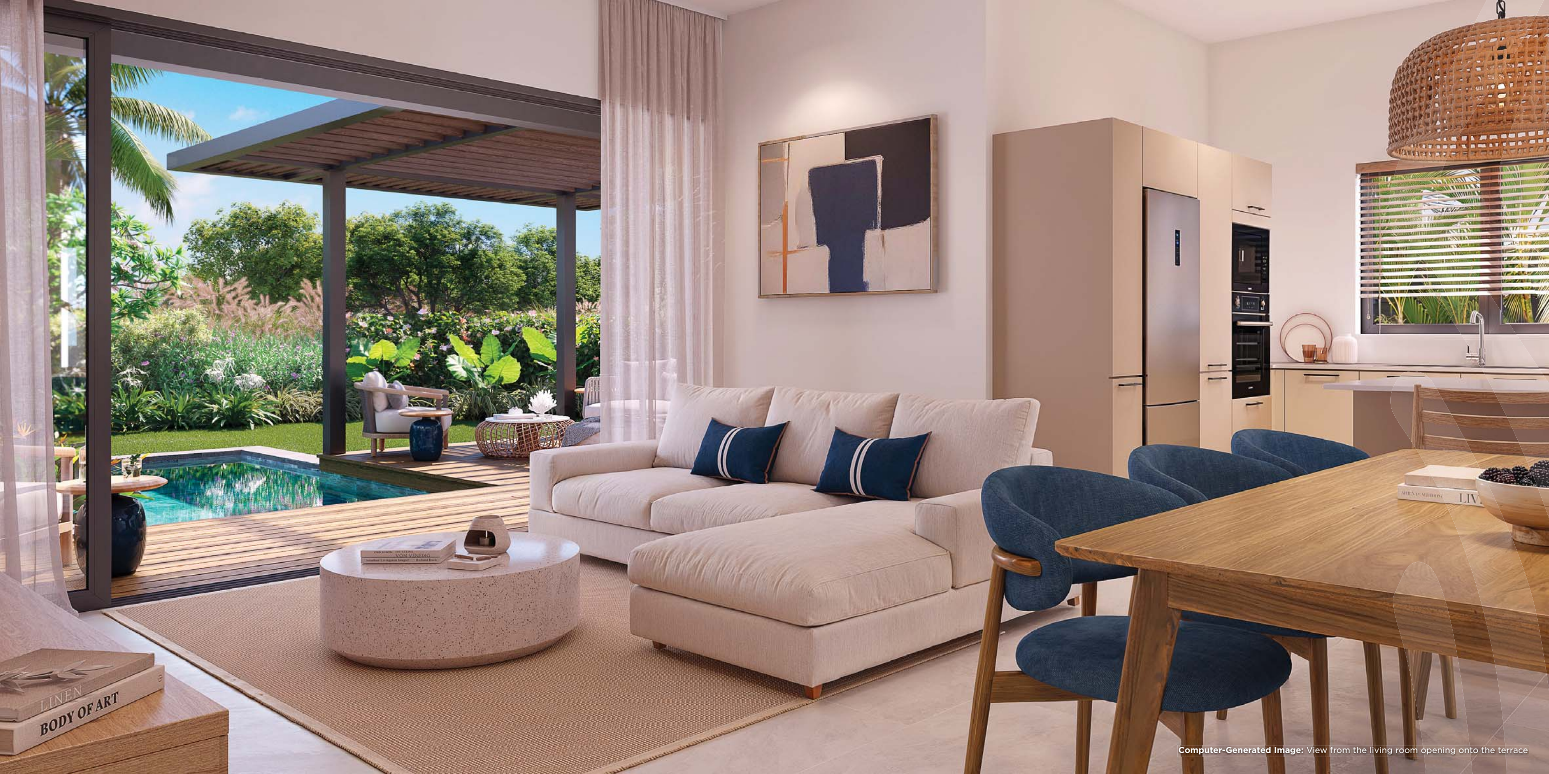
Computer-Generated Image: View from the living room opening onto the terrace