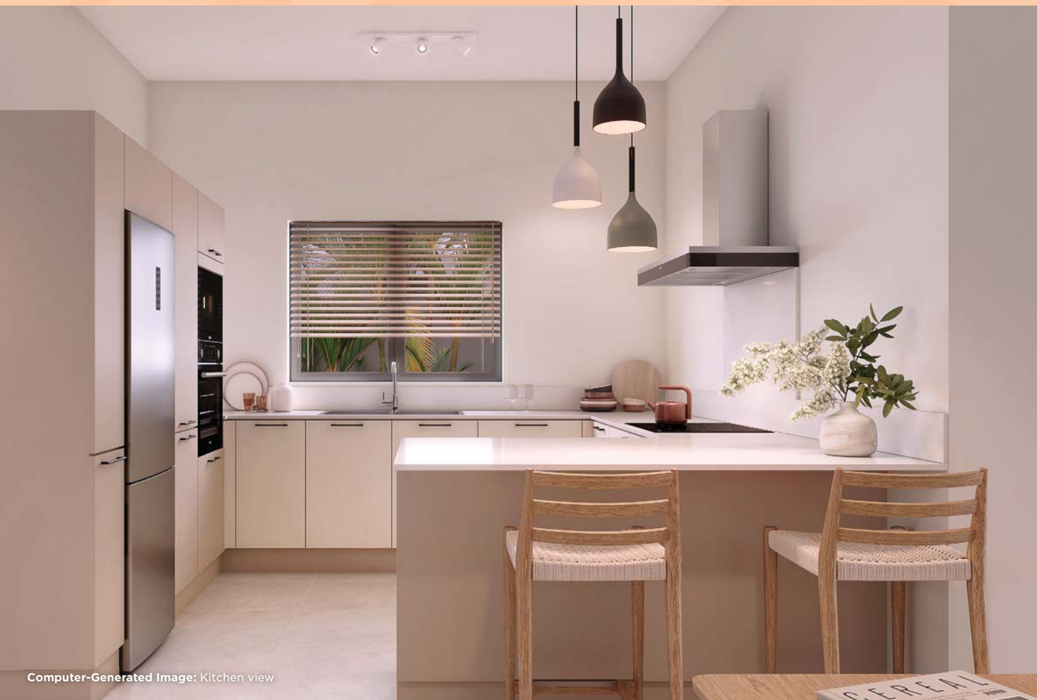
Computer-Generated Image: Kitchen view