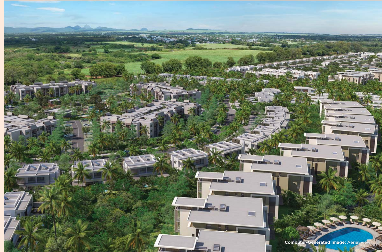
Computer-Generated Image: Aerial view

From your first step outside, you are met with light, clear views, and a softened atmosphere. The kind of detail that speaks quietly, yet makes its presence felt every day.